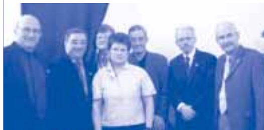
> Steering Committee meeting – Zagreb, April 2004