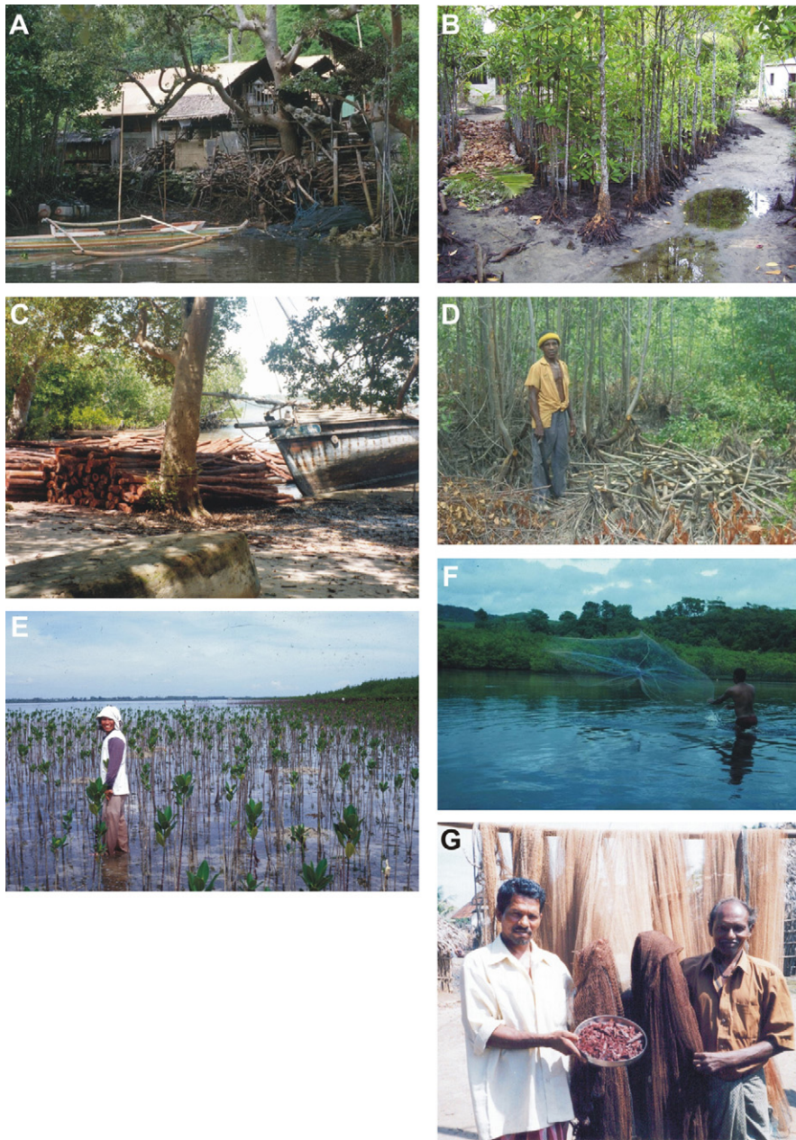
Fig. 1. (A) Fishermen in Bais Bay, Philippines commonly build their homes adjacent to mangroves where they gain ready access to wood products and favored fishing spots, and benefit from the storm protective value of mangrove trees. (B) An illustration of the concept of living in mangroves in Balapitiya, Sri Lanka: houses were built within a mangrove and Bruguiera gymnorhiza assemblages were cut in such a way that they form access paths to each house. (C) Mangrove poles at the Sita landing place in Mida Creek, Kenya waiting to be transported to markets and hardware stores. (D) Mangroves in Mankote, Saint Lucia are often cut to make charcoal, a fuel preferred by many West Indians for barbecuing. (E) Gleaners like this woman on Banacon Island, Philippines are free to harvest for shellfish within a plantation of Rhizophora stylosa as long as they do not disturb the young trees. (F) Simple fishing techniques like this throw-net are effective for capturing fish in the murky, brackish waters of the Mankote mangrove, Saint Lucia. (G) Fishermen holding a tray with pieces of Ceriops decandra bark used for dyeing fishing nets near Kakinada in Andhra Pradesh, India. They also show two freshly dyed nets and in the background previously dyed nets are hung to dry. Adopted from Dahdouh-Guebas (2006).

and wood fiber (to make rayon and paper); as sources of animal fodder, vegetable foods, and diverse traditional medicines and toxicants (see Bandaranayake, 1998, 2002 for a reviews); and as habitats for honey bees and hunted wildlife (see Table 1; Fig. 1G).